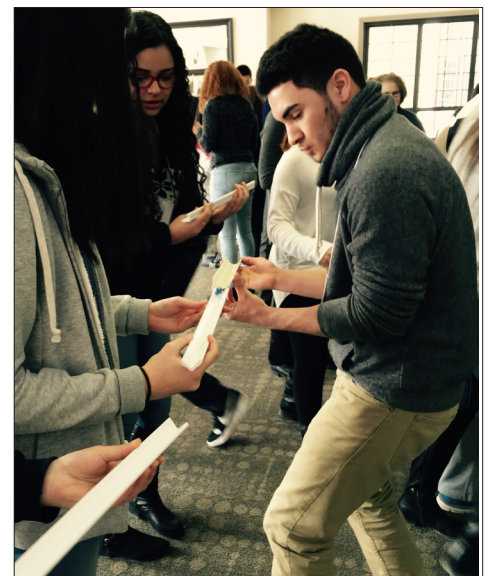
Mentees work together in team building activity

The visit emboldened our students to believe in themselves and kicked off what we believe will be a well-connected T 2 cohort. The T 2 mentees and mentors left the event feeling optimistic and energized about the road ahead!