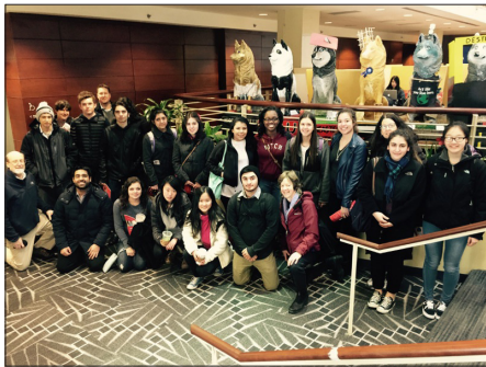
T 2 Class of 2016 Visit to Northeastern University on March 12, 2015