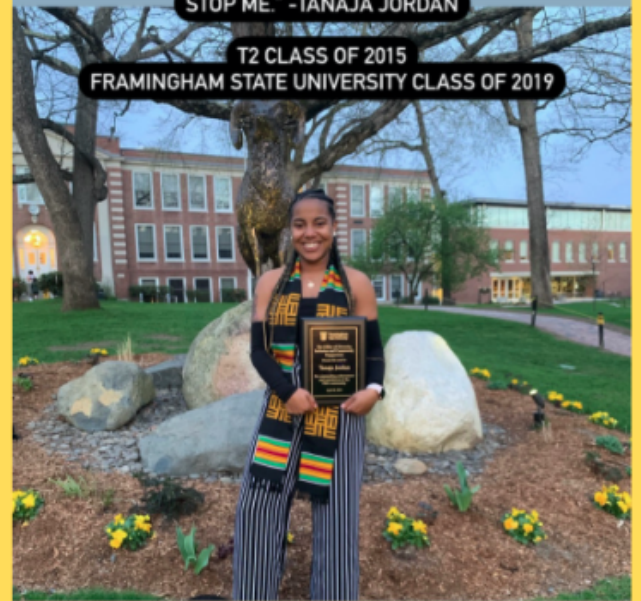
T2 CLASS OF 2015 FRAMINGHAM STATE UNIVERSITY CLASS OF 2019

Being a first generation student pushes me to work harder in school to achieve my goals and make my parents proud! Being the first to go to college is intimidating but all the same it gives me motivation to push myself harder